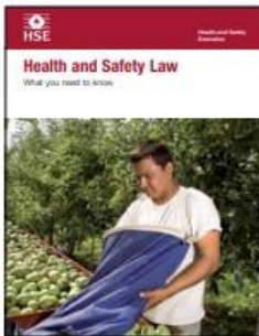
This is a web-friendly version of the Health and Safety Law leaflet published 04/09

All workers have a right to work in places where risks to their health and safety are properly controlled. Health and safety is about stopping you getting hurt at work or ill through work. Your employer is responsible for health and safety, but you must help.